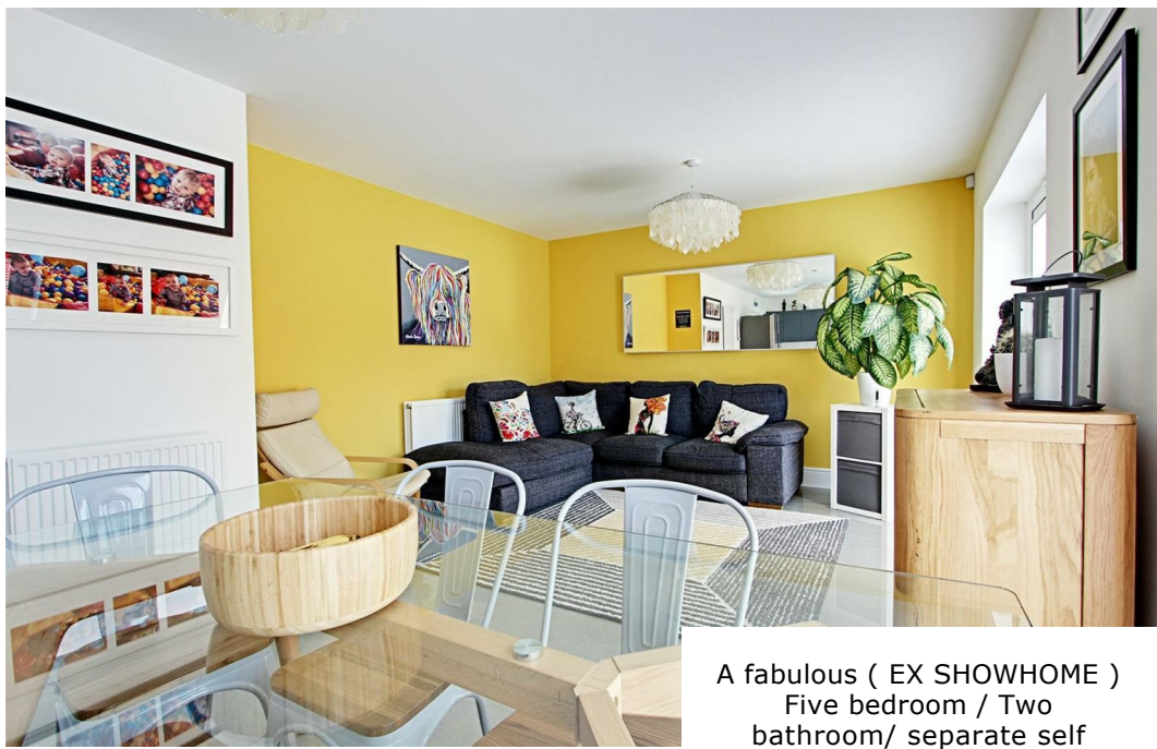
A fabulous ( EX SHOWHOME ) Five bedroom / Two bathroom/ separate self contained Home office/study, family home in the heart of this ever popular Bucks Village.